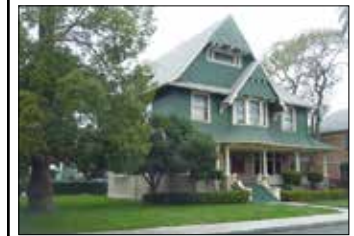
WOODCRAFT MANOR 2111 Park Grove Avenue 9 Bedrooms - $10,000/month

ROBINSON RESIDENCES RENTING NOW FOR FALL 2023: THE FINEST HOUSES IN UNIVERSITY PARK