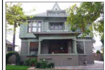
MONTGOMERY HOUSE 1010 West 21st Street 7 Bedrooms - $7,500/month