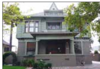
MONTGOMERY HOUSE 1010 West 21st Street 7 Bedrooms - $7,500/month