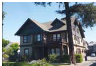
GRIFFITH HALL 939 West 21st Street Twin Studios - $2,200/month

ALL OUR HISTORIC HOUSES ARE NORTH OF CAMPUS IN USC'S PUBLIC SAFETY ZONE