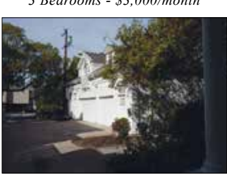
THE CARRIAGE HOUSE 23 St. James Park Unique 2-Bedroom Apt. on Leafy Estate - $2,800/month

ALL OUR HISTORIC HOUSES ARE NORTH OF CAMPUS IN USC'S PUBLIC SAFETY ZONE