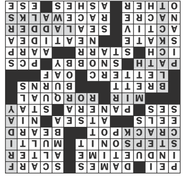
ANSWER TO TODAY'S PUZZLE