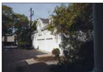
THE CARRIAGE HOUSE 23 St. James Park Unique 2-Bedroom Apt. on Leafy Estate - $2,800/month

ALL OUR HISTORIC HOUSES ARE NORTH OF CAMPUS IN USC'S PUBLIC SAFETY ZONE