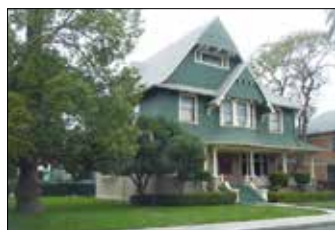
WOODCRAFT MANOR 2111 Park Grove Avenue 9 Bedrooms - $10,000/month