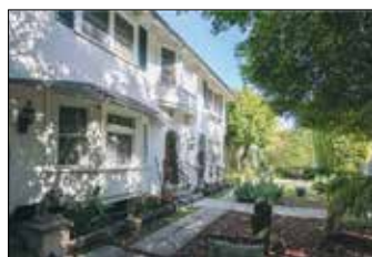
PARK VILLA 663 West 23rd Street Rooms/Suites - Private Baths For Graduate Students Only