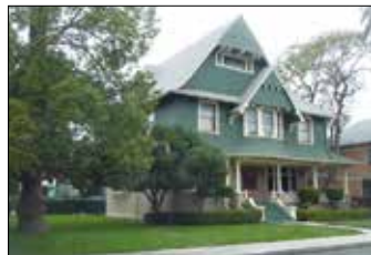
WOODCRAFT MANOR 2111 Park Grove Avenue 9 Bedrooms - $10,000/month