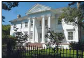
THE COLONEL'S MANSION 27 St. James Park 3 Bedrooms - $3,000/month