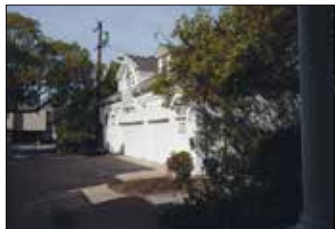
THE CARRIAGE HOUSE 23 St. James Park Unique 2-Bedroom Apt. on Leafy Estate - $2,800/month

ALL OUR HISTORIC HOUSES ARE NORTH OF CAMPUS IN USC'S PUBLIC SAFETY ZONE Details, photos, floor plans on www.RobinsonResidences.com Call/text (213) 663-3023