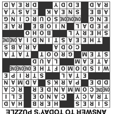
ANSWER TO TODAY'S PUZZLE