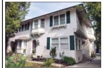
PARK VILLA 663 West 23rd Street Graduate Students Only Rooms from $975/month

ALL OUR HISTORIC HOUSES ARE NORTH OF CAMPUS IN USC'S PUBLIC SAFETY ZONE