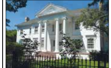
THE COLONEL'S MANSION 27 St. James Park Private room - $1,150/month