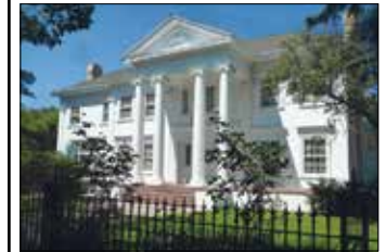
THE COLONEL'S MANSION 27 St. James Park Rooms from $1,050/month