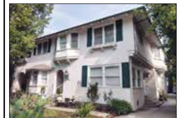
PARK VILLA 663 West 23rd Street Graduate Students Only Rooms from $975/month

ALL OUR HISTORIC HOUSES ARE NORTH OF CAMPUS IN USC'S PUBLIC SAFETY ZONE