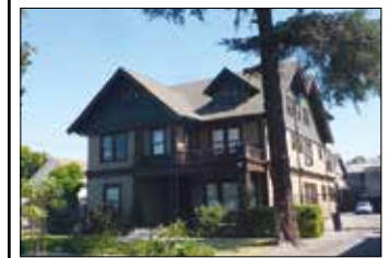
GRIFFITH HALL 939 W. 21st Street Rooms from $1,200/month

ROBINSON RESIDENCES RENTING NOW FOR FALL 2024: THE FINEST HOUSES IN UNIVERSITY PARK