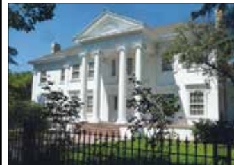
THE COLONEL'S MANSION 27 St. James Park Rooms from $1,050/month