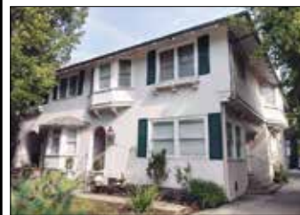
PARK VILLA 663 West 23rd Street Graduate Students Only Private rooms - $1,200/month

ALL OUR HISTORIC HOUSES ARE NORTH OF CAMPUS IN USC'S PUBLIC SAFETY ZONE