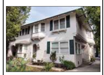
PARK VILLA 663 West 23rd Street Graduate Students Only Largest unit - $1,500/month

ALL OUR HISTORIC HOUSES ARE NORTH OF CAMPUS IN USC'S PUBLIC SAFETY ZONE