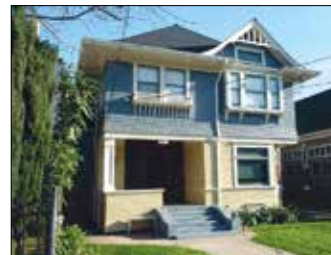
WESTON HOUSE 2112 Portland Street 6 Bedrooms - $7,500/month

ALL OUR HISTORIC HOUSES ARE NORTH OF CAMPUS IN USC'S PUBLIC SAFETY ZONE