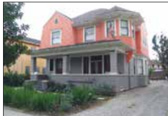
ARABELLA'S HOUSE 2120 Oak Street 6 Bedrooms - $7,500/month