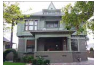
MONTGOMERY HOUSE 1010 West 21st Street 7 Bedrooms - $8,000/month