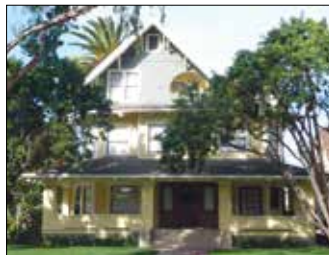
WALLACE HOUSE 2365 Scarff Street 7 Bedrooms - $8,000/month