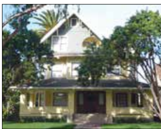
WALLACE HOUSE 2365 Scarff Street 7 Bedrooms - $8,000/month