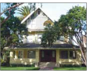
WALLACE HOUSE 2365 Scarff Street 7 Bedrooms - $8,000/month