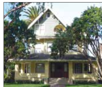
WALLACE HOUSE 2365 Scarff Street 7 Bedrooms - $8,000/month