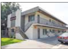
The Palms on 27th 1140 W. 27th St.

GF PROPERTY GROUP A Premier Provider of Houses & Apartments for USC Students for over 25 Years