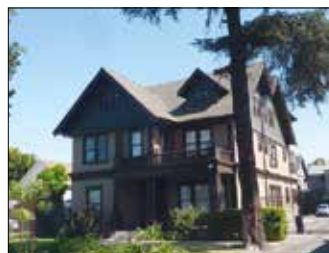
GRIFFITH HALL 939 W. 21st Street Twin Studios - $1,150/room