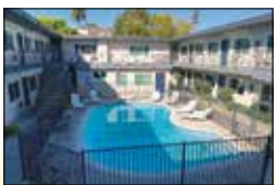
The Caribbean 935 W. 30th St.