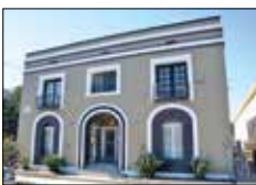
Portland Apartments 2361-63 Portland Ave.

Visit us at gfpropertygroup.net to see virtual tours, apartment photos & layouts. Contact us at 949-235-1103 to get more information and to schedule a viewing.