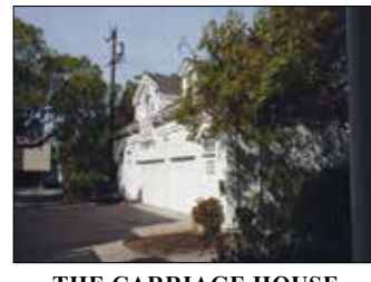
THE CARRIAGE HOUSE 23 St. James Park Unique 2 Bdrm Apt. on Leafy Estate - $2,800/month

ALL OUR HISTORIC HOUSES ARE NORTH OF CAMPUS IN USC'S PUBLIC SAFETY ZONE