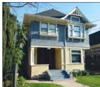
WESTON HOUSE 2112 Portland Street 6 Bedrooms - $7,500/month