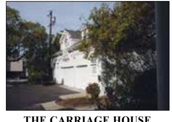
THE CARRIAGE HOUSE 23 St. James Park Unique 2 Bdrm Apt. on Leafy Estate - $2,800/month

ALL OUR HISTORIC HOUSES ARE NORTH OF CAMPUS IN USC'S PUBLIC SAFETY ZONE