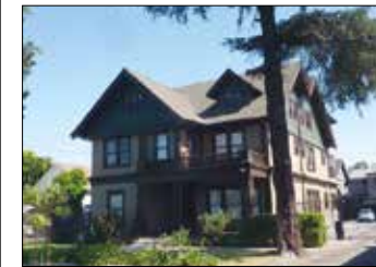
GRIFFITH HALL 939 W. 21st Street Twin Studios - $1,150/room