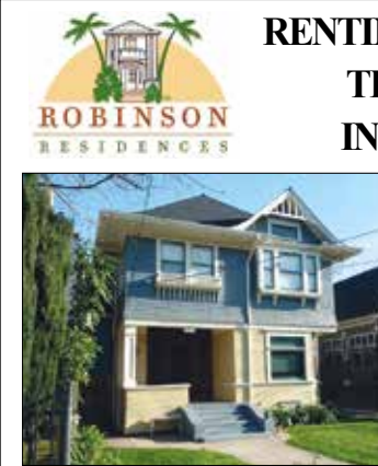
WESTON HOUSE 2112 Portland Street 6 Bedrooms - $7,500/month