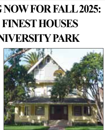
WALLACE HOUSE 2365 Scarff Street 7 Bedrooms - $8,000/month