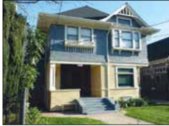
WESTON HOUSE 2112 Portland Street Grad Rooms - $1,100/month

ALL OUR HISTORIC HOUSES ARE NORTH OF CAMPUS IN USC'S PUBLIC SAFETY AND FREE LYFT/BUS ZONE