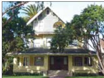
WALLACE HOUSE 2365 Scarff Street Rooms from $950/month