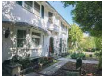
PARK VILLA 663 West 23rd Street Grads from $1,000/month