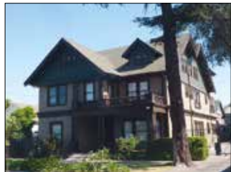
GRIFFITH HALL 939 West 21st Street Studios and twin-studios

WALK/BIKE TO CAMPUS ** LARGE ROOMS ** GREAT PARKING