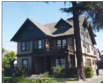
GRIFFITH HALL 939 West 21st Street Studios and twin-studios

WALK/BIKE TO CAMPUS ** LARGE ROOMS ** GREAT PARKING