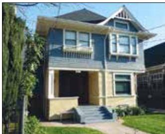
WESTON HOUSE 2112 Portland Street Grad Rooms - $1,100/month

ALL OUR HISTORIC HOUSES ARE NORTH OF CAMPUS IN USC'S PUBLIC SAFETY AND FREE LYFT/BUS ZONE