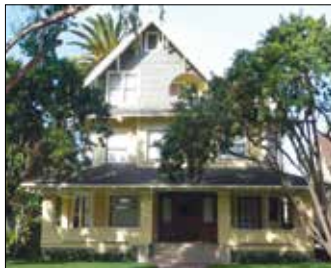
WALLACE HOUSE 2365 Scarff Street Rooms from $950/month