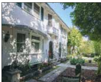
PARK VILLA 663 West 23rd Street Grads from $1,000/month